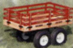
Trailer - Model #1320

Bed Size: 24"x54" Load Capacity: 1,000 lbs. Air Tires: 13" (4.00/6)