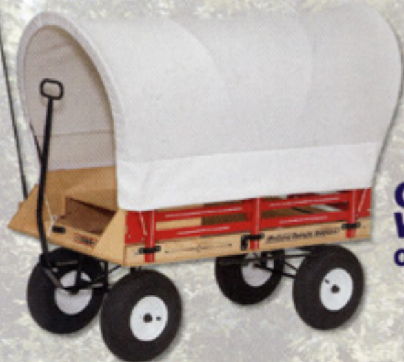
Covered Wagon Kit Option #100