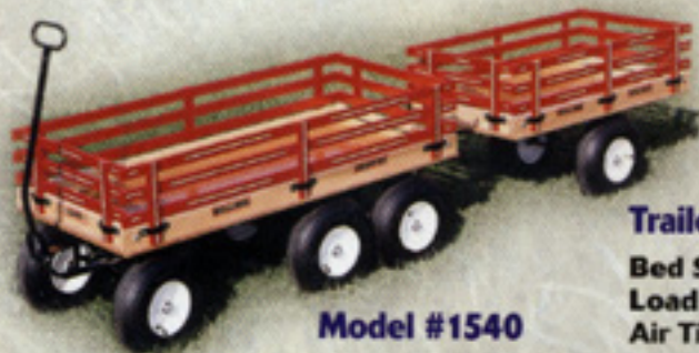
Trailer - Model #1310

Bed Size: 22"x40" Load Capacity: 500 lbs. Air Tires : 13" (4.00/6)